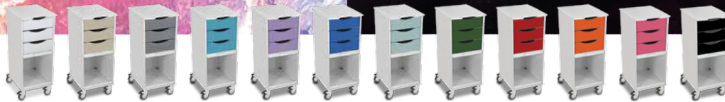
White Almond Beige Silver Metallic Bahamas Sea Teal Gum Drop Purple Global Blue Catalina Mist Green Hosta Leaf Green Cherry Red Pumpkin Orange Watermelon Pink Black