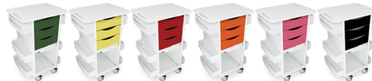
Hosta Leaf Green