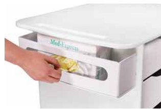
Dispensing Side Shelf for Gloves and Wipers