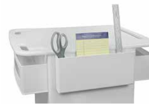
Rear Mount Tool Holder